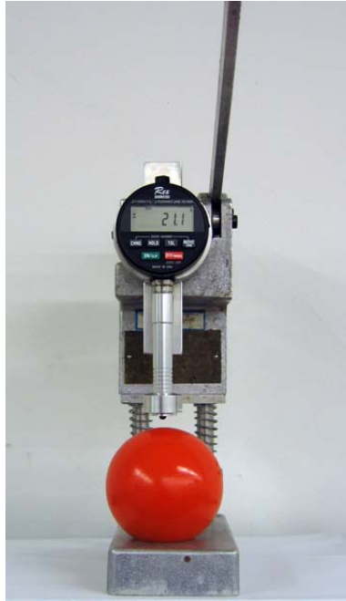
Figure 1. Photo of a durometer in a lever-operated drill stand. The unit can be operated without the stand.